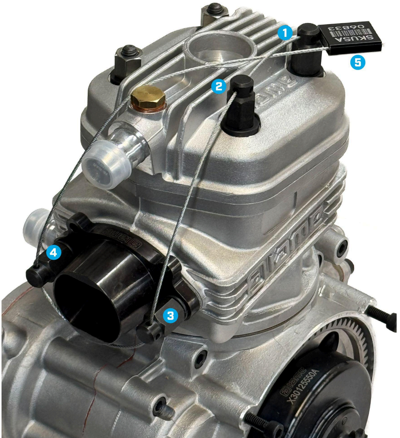
Engine Seal Installation