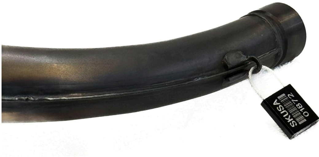
Pipe Seal Installation